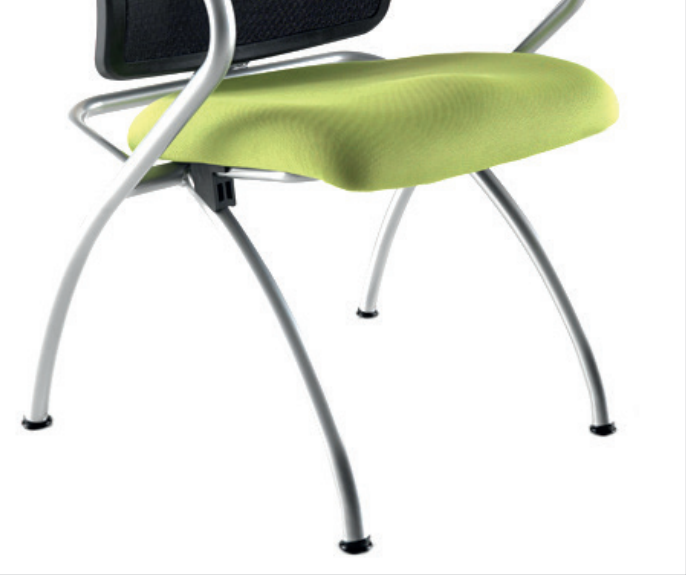
FLIPPER - GM-FS / SPACE-SAVING STORAGE