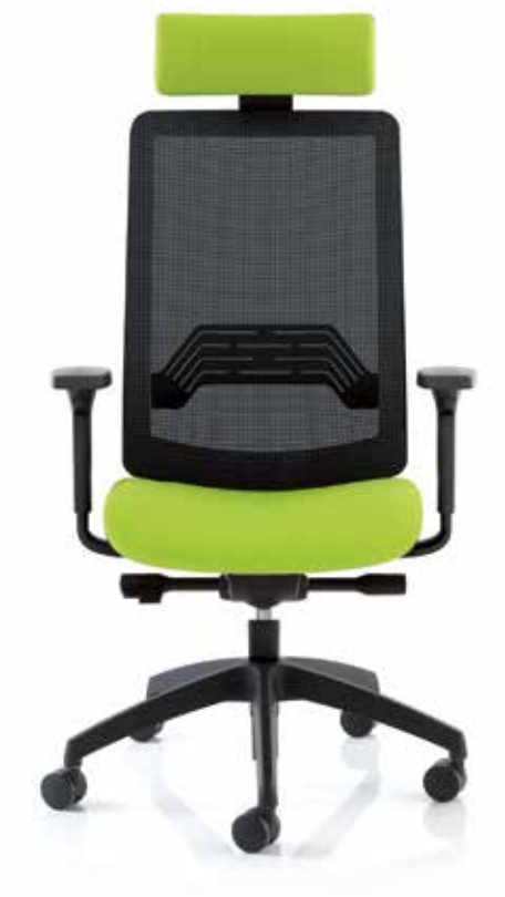
The mesh AFFINITi task chair features an optional adjustable lumbar support.