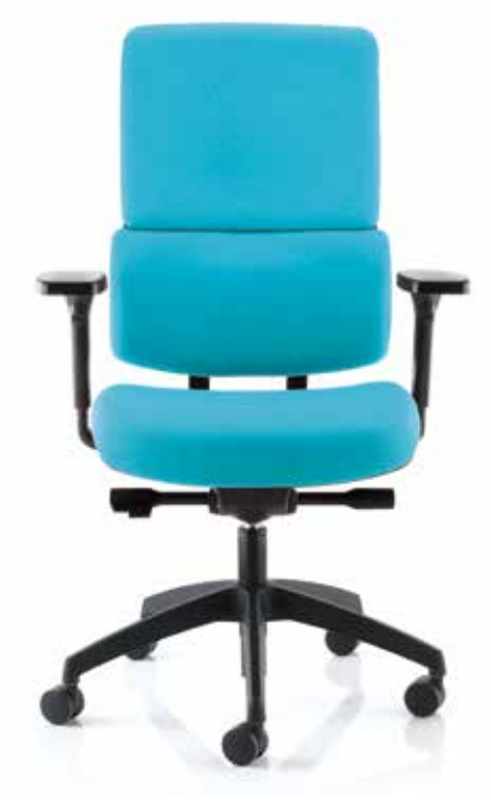
The upholstered AFFINITi task chair features a high backrest made up of two upholstered sections for optimal support and comfort.