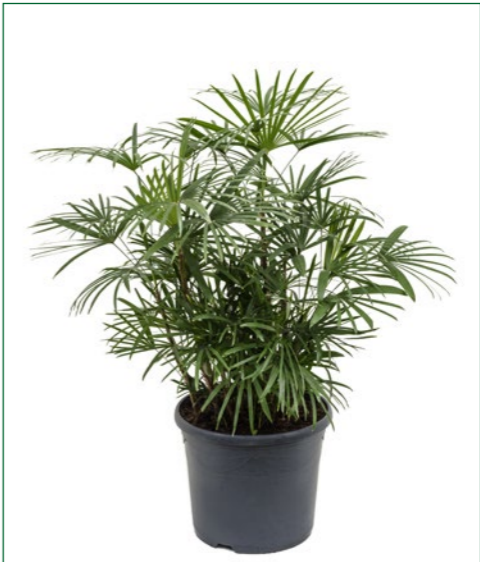
Artcode: 4RHHUBU20 Description: Rhaps humilis Form: Bush Pot: 31 Height: 110