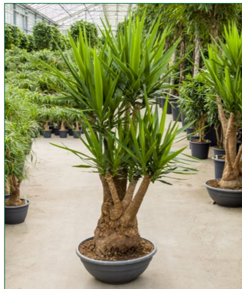
Artcode: 4YUELVT76 Description: Yucca elephantipes Form: Branched Pot: 60 Height: 200