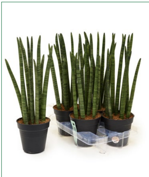
Artcode: 4SACYTU07 Description: Sansevieria tower 4/tray Form: Tuft Pot: 15 Height: 50