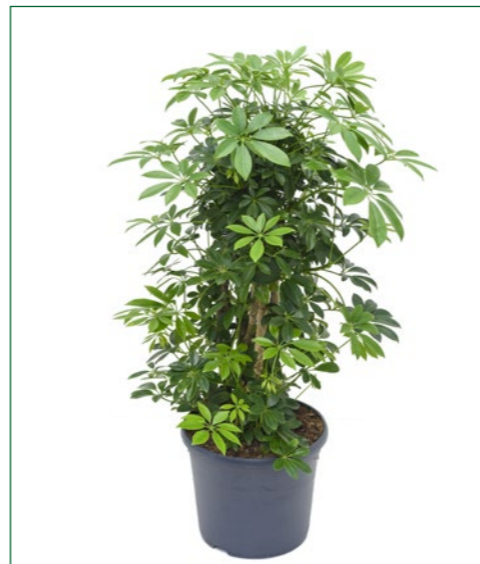
Artcode: 4SCARSS40 Description: Schefflera arboricola Form: Branched/column Pot: 31 Height: 120