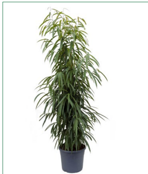
Artcode: 4FIAL1T21 Description: Ficus alii Form: Tuft (180-200) Pot: 35 Height: 180