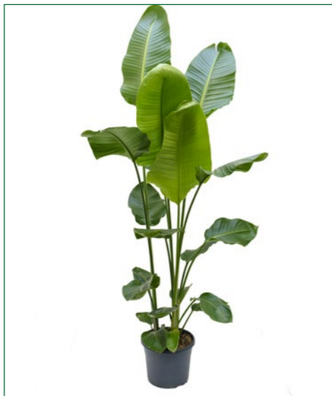
Artcode: 4STNITU27 Description: Strelitzia nicolai Form: Tuft Pot: 29 Height: 175