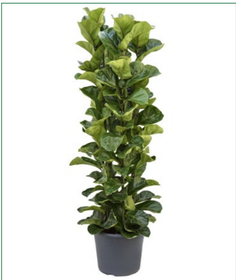
Artcode: 4FILB4T15 Description: Ficus lyrata bambino Form: Toef 4pp Pot: 35 Height: 150