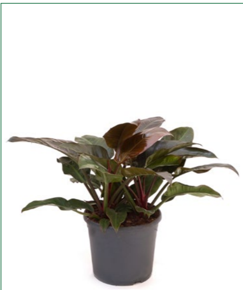
Artcode: 4PHIRBU22 Description: Philodendron imperial red Form: Bush Pot: 35 Height: 80