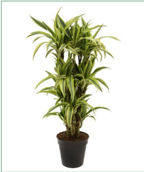
Artcode: 4DRLLVT18 Description: Dracaena Lemon Lime Form: Branched-multi Pot: 24 Height: 110