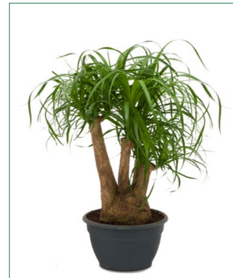
Artcode: 4BEREVT08 Description: Beaucarnea recurvata Form: Branched (40) saucer ø20 Pot: 25 Height: 80