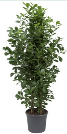
Artcode: 4FIM03T08 Description: Ficus molclame Form: Tuft Pot: 35 Height: 180