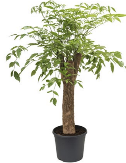
Artcode: 4HECHVT06 Description: Heteropanax chinensis Form: Branched Pot: 35 Height: 140