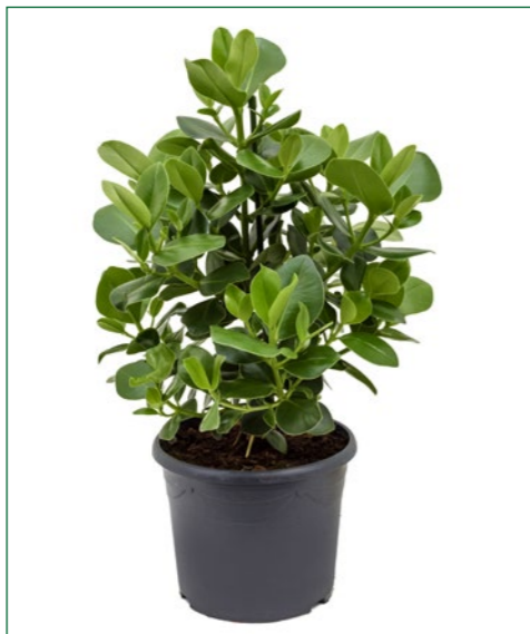
Artcode: 4CLRP1T08 Description: Clusia rosea princess Form: Bush 1pp Pot: 29 Height: 80