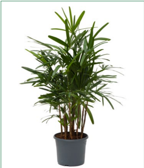
Artcode: 4RHEXBU66 Description: Rhaps excelsa Form: Tuft Pot: 29 Height: 110