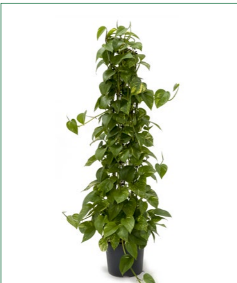
Artcode: 4SCAUZU03 Description: Scindapsus (epipremnum) aureum Form: Column Pot: 26 Height: 120