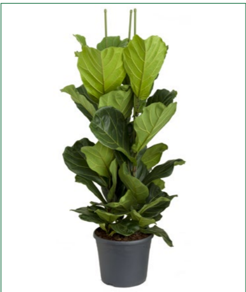
Artcode: 4FILY3T10 Description: Ficus lyrata Form: Tuft Pot: 35 Height: 150