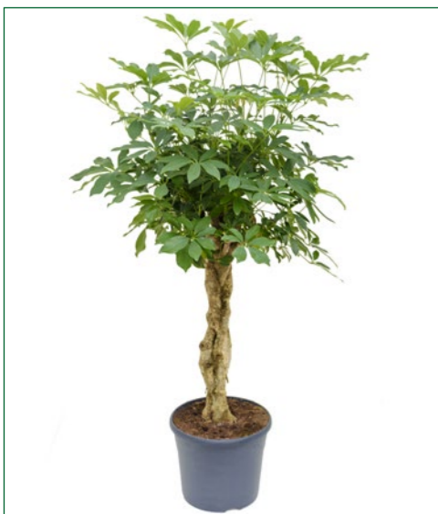
Artcode: 4SCARG518 Description: Schefflera arboricola Form: Stem braided Pot: 31 Height: 130