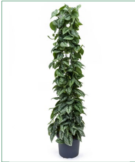
Artcode: 4SCPTZU18 Description: Scindapsus pictus trebie Form: Column Pot: 29 Height: 150