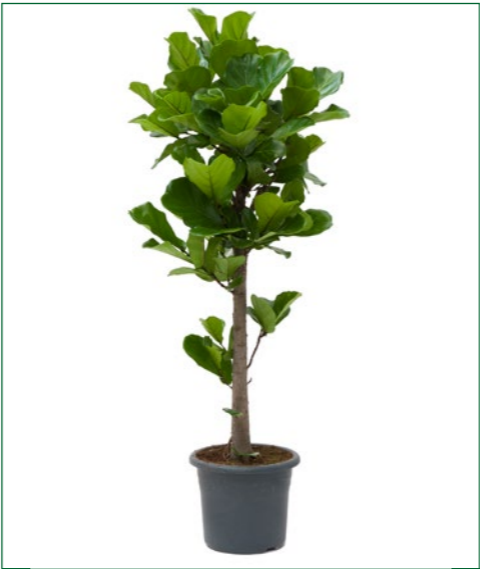
Artcode: 4FILYRS10 Description: Ficus lyrata Form: Stem (180-200) Pot: 40 Height: 190