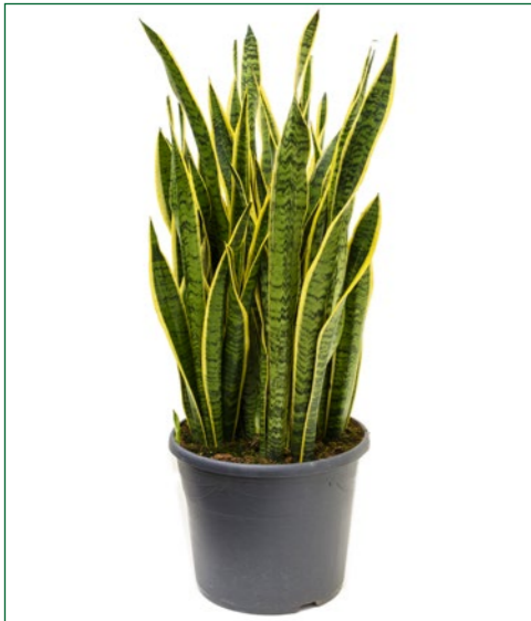
Artcode: 4SALATU35 Description: Sansevieria laurentii Form: Tuft Pot: 35 Height: 75