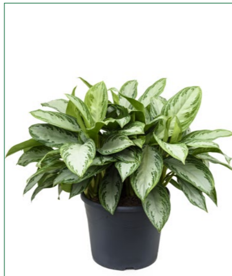
Artcode: 4AGSBBU22 Description: Aglaonema silver bay Form: Tuft Pot: 35 Height: 70