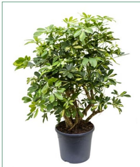
Artcode: 4SCGCVT12 Description: Schefflera gold capelle Form: Branched Pot: 31 Height: 120