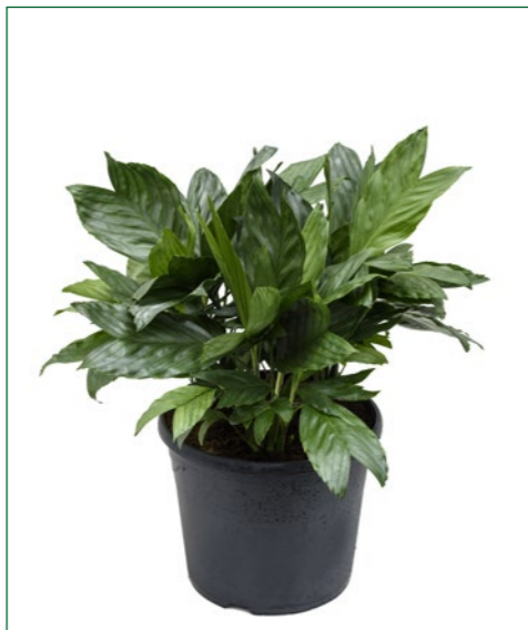
Artcode: 4CHMEBU20 Description: Chamaedorea metalica Form: Bush Pot: 35 Height: 40