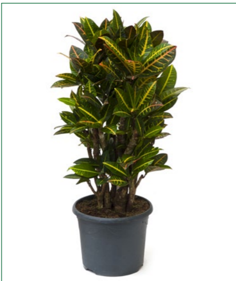
Artcode: 4COPEVT03 Description: Croton (codiaeum) Petra Form: Branched Pot: 26 Height: 80