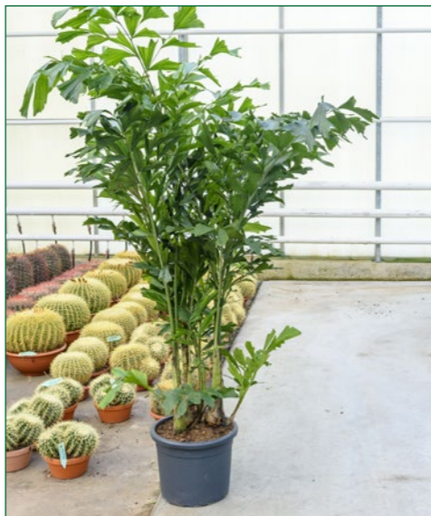
Artcode: 4CAMIBU28 Description: Caryota mitis Form: Bush Pot: 40 Height: 200