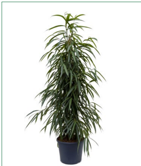
Artcode: 4FIAL1T18 Description: Ficus alii Form: Tuft Pot: 35 Height: 150