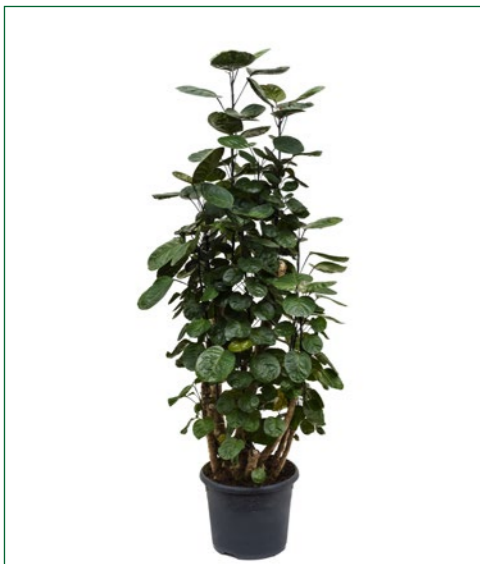
Artcode: 4POFAVT41 Description: Aralia (polyscias) fabian Form: Branched (90-100) Pot: 26 Height: 110