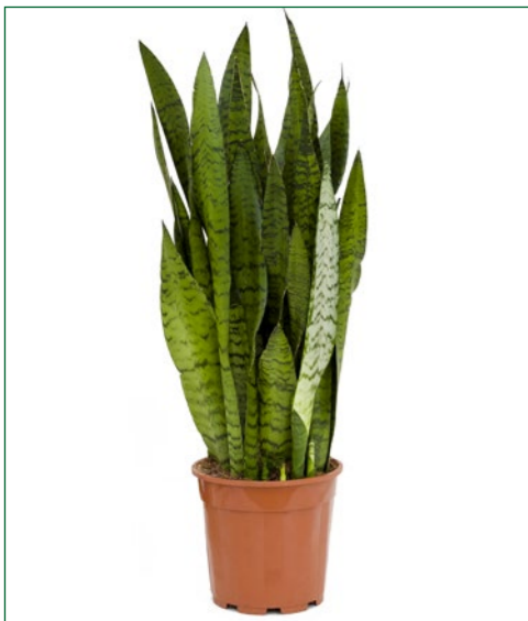
Artcode: 4SAZETU08 Description: Sansevieria zeylanica Form: Tuft Pot: 21 Height: 70