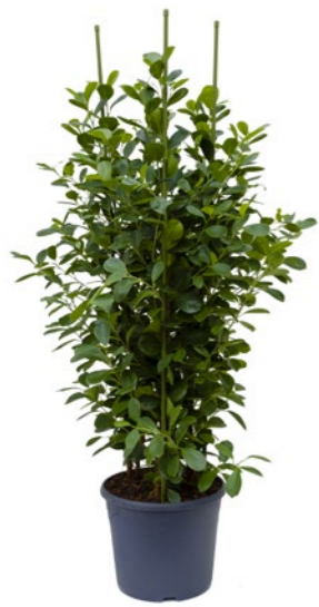
Artcode: 4FIM03T05 Description: Ficus molclame Form: Tuft (140-160) Pot: 35 Height: 150