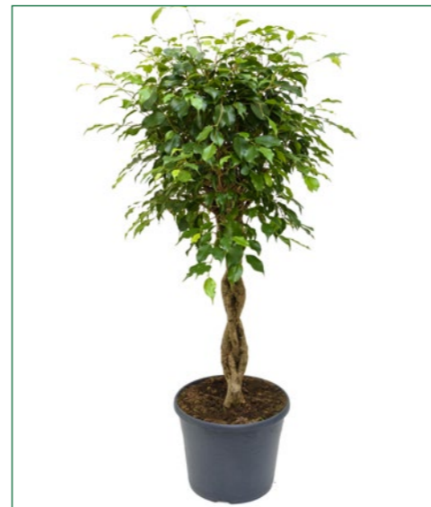
Artcode: 4FIBEGS12 Description: Ficus benjamina Form: Stem braided Pot: 35 Height: 150