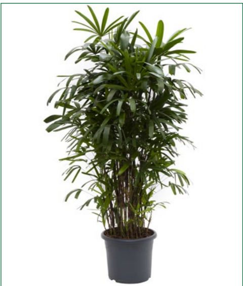
Artcode: 4RHEXBU77 Description: Rhaps excelsa Form: Tuft (170-190) Pot: 40 Height: 200