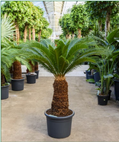
Artcode: 4CYRESS82 Description: Cycas Revoluta Form: Stem (50-60) Pot: 40 Height: 140