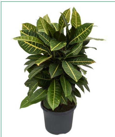
Artcode: 4COPEVT09 Description: Croton (codiaeum) Petra Form: Branched Pot: 21 Height: 70