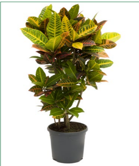
Artcode: 4COPEVT13 Description: Croton (codiaeum) Petra Form: Branched Pot: 29 Height: 110