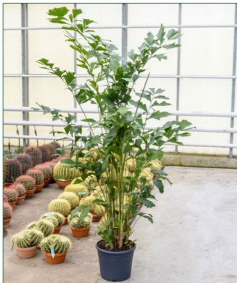
Artcode: 4CAMIBU05 Description: Caryota mitis Form: Bush Pot: 35 Height: 180