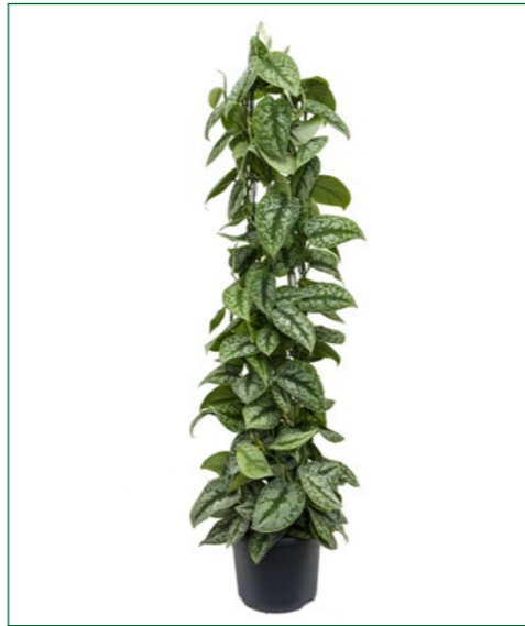
Artcode: 4SCPTZU13 Description: Scindapsus pictus trebie Form: Column Pot: 26 Height: 120