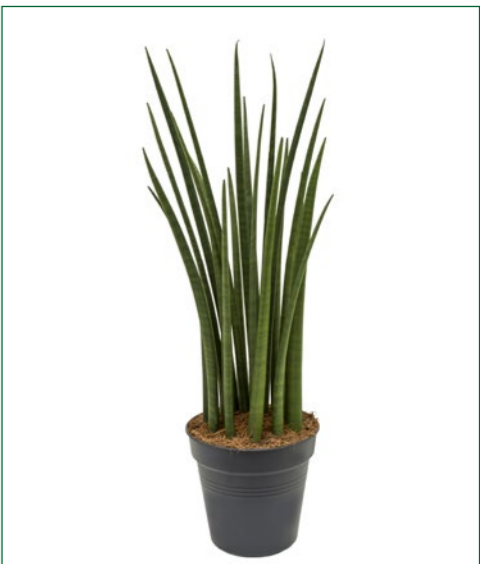
Artcode: 4SASPTU15 Description: Sansevieria spikes Form: Tuft Pot: 19 Height: 70