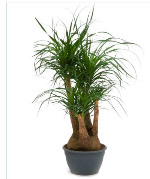
Artcode: 4BEREVT29 Description: Beaucarnea recurvata Form: Branched (60) saucer ø25 Pot: 30 Height: 100