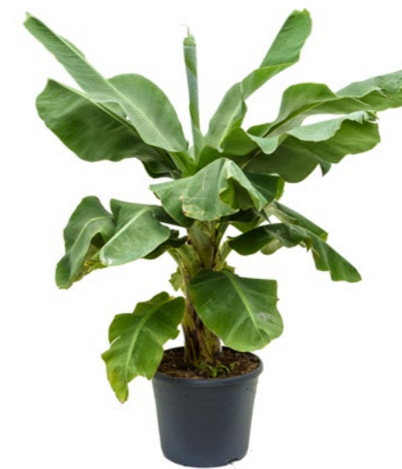
Artcode: 4MUDCRS20 Description: Musa dwarf cavendish Form: Stem Pot: 35 Height: 120