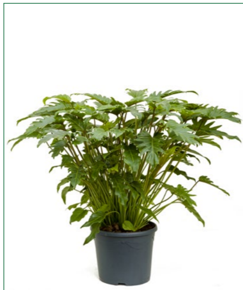
Artcode: 4PHXABU10 Description: Philodendron xanadu Form: Bush Pot: 31 Height: 80