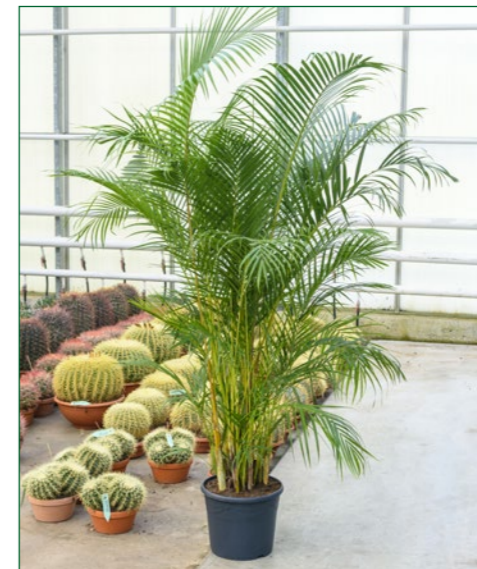
Artcode: 4CHLUBU26 Description: Areca (chrysalidoc.) lutescens Form: Tuft Pot: 35 Height: 200