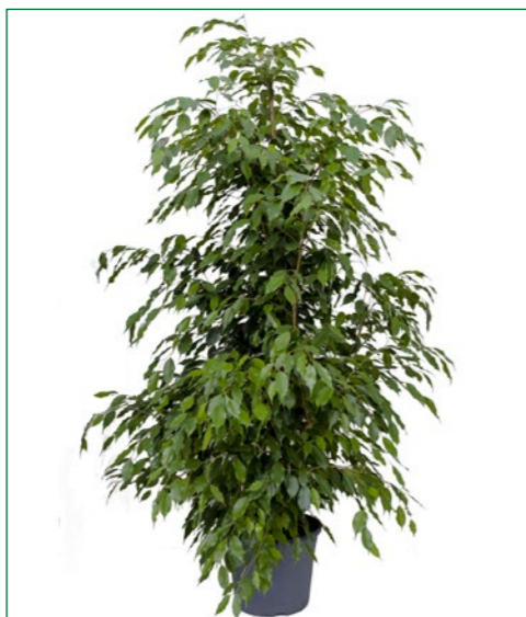
Artcode: 4FIBE1T21 Description: Ficus benjamina Form: Tuft Pot: 35 Height: 180