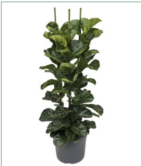
Artcode: 4FILB3T12 Description: Ficus lyrata bambino Form: Tuft 3pp Pot: 31 Height: 120