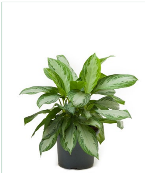
Artcode: 4AGSBBU20 Description: Aglaonema silver bay Form: Tuft Pot: 26 Height: 40