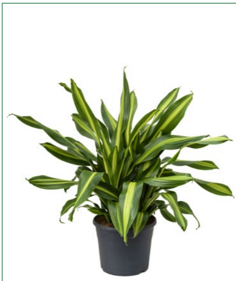
Artcode: 4DRBUK025 Description: Dracaena Burley Form: Head 3pp Pot: 35 Height: 90