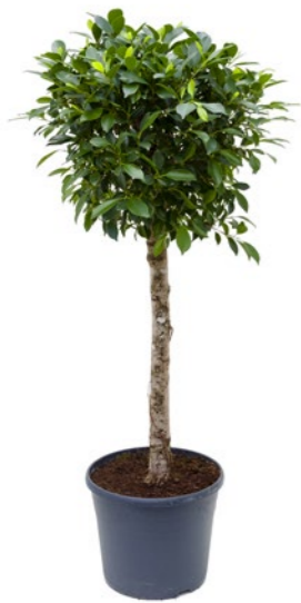
Artcode: 4FINIRS44 Description: Ficus nitida Form: Stem Pot: 35 Height: 140