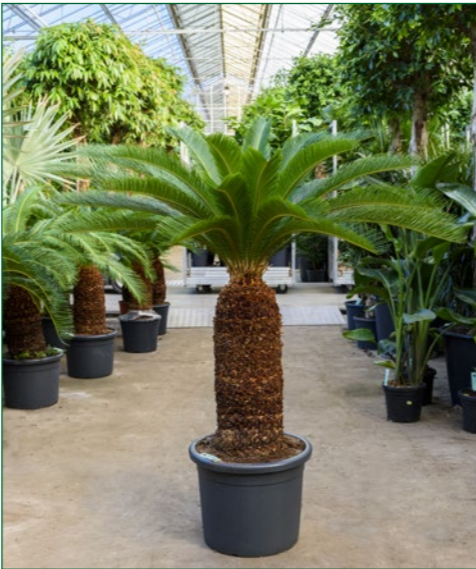
Artcode: 4CYRESS84 Description: Cycas Revoluta Form: Stem (70) Pot: 45 Height: 170