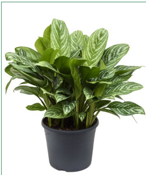
Artcode: 4AGSTBU27 Description: Aglaonema stripes Form: Bush Pot: 35 Height: 80