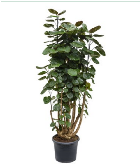
Artcode: 4POFAVT42 Description: Aralia (polyscias) fabian Form: Branched Pot: 29 Height: 160