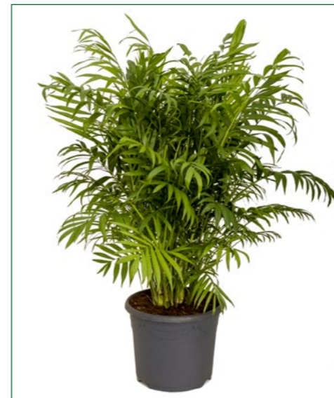
Artcode: 4CHELTU25 Description: Chamaedorea elegans Form: Tuft Pot: 26 Height: 60