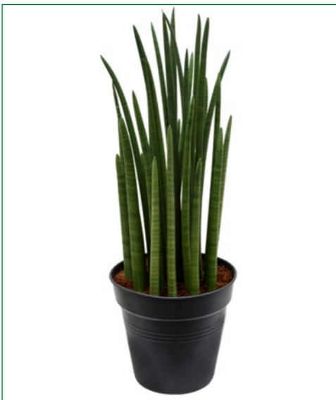
Artcode: 4SACYTU16 Description: Sansevieria tower Form: Tuft Pot: 35 Height: 100