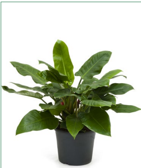
Artcode: 4PHIGBU25 Description: Philodendron imperial green Form: Bush Pot: 35 Height: 90