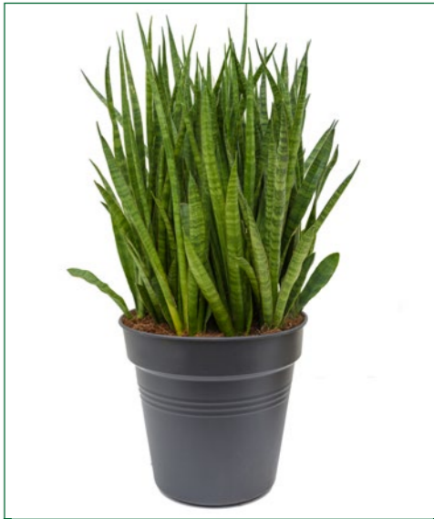
Artcode: 4SAKIBU40 Description: Sansevieria kirkii Form: Tuft Pot: 35 Height: 80