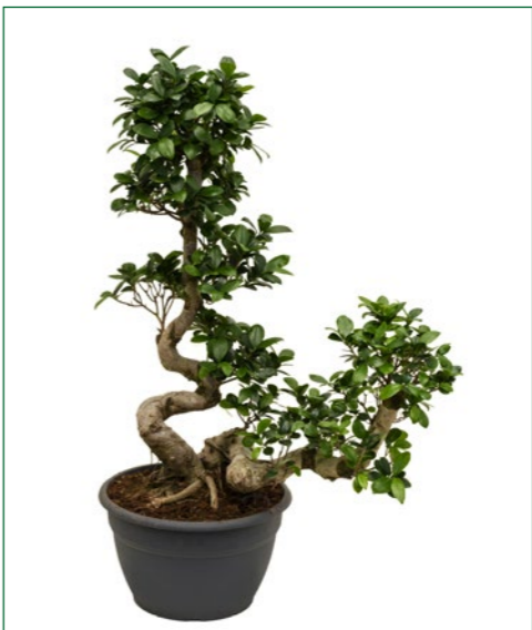
Artcode: 4FIMIHA08 Description: Ficus microcarpa compacta Form: S-stem+cascade Pot: 35 Height: 110