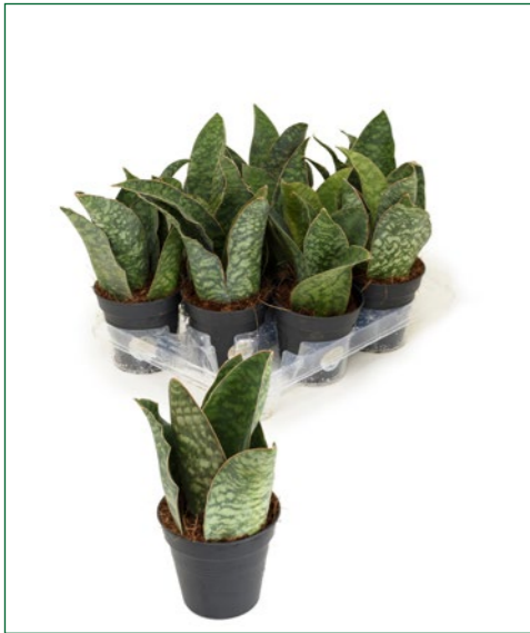
Artcode: 4SAGOTU01 Description: Sansevieria masiona gongo 9/tray Form: Tuft Pot: 11 Height: 30