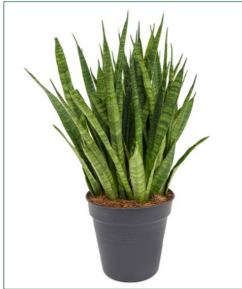
Artcode: 4SAKIBU30 Description: Sansevieria kirkii Form: Tuft Pot: 21 Height: 70