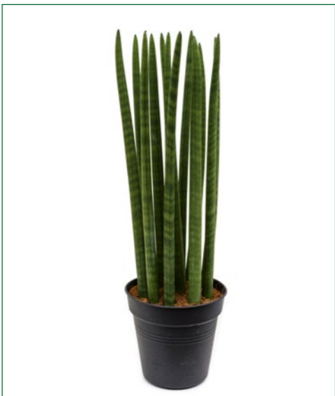
Artcode: 4SACSTU57 Description: Sansevieria straight Form: Tuft Pot: 21 Height: 70