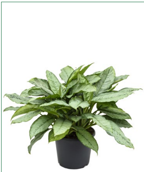
Artcode: 4AGFRBU15 Description: Aglaonema freedman Form: Tuft Pot: 35 Height: 80