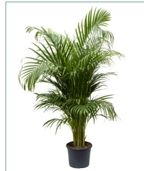
Artcode: 4CHLUBU06 Description: Areca (chrysalidoc.) lutescens Form: Tuft Pot: 26 Height: 140