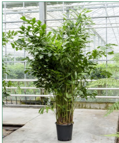
Artcode: 4CAMIBU37 Description: Caryota mitis Form: Bush (275-300) Pot: 45 Height: 275