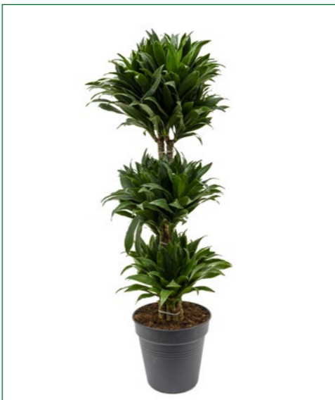
Artcode: 4DRCOBA06 Description: Dracaena Compacta Form: 60-Ballerina Pot: 24 Height: 80