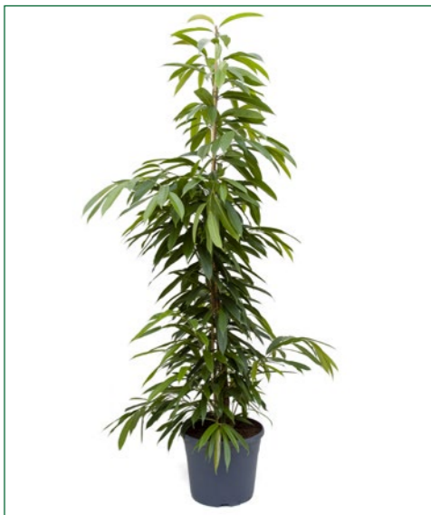
Artcode: 4FIAK1T21 Description: Ficus amstel king Form: Tuft Pot: 35 Height: 180