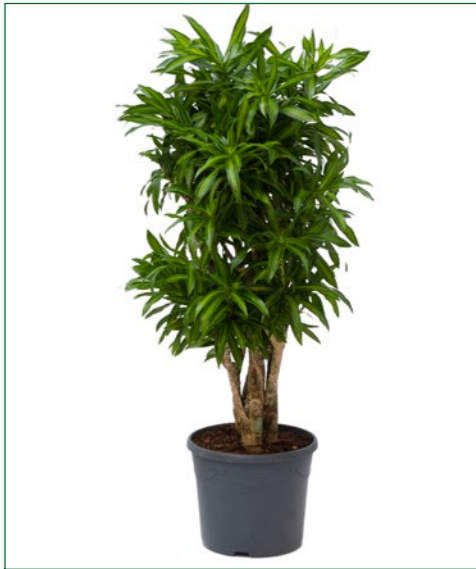
Artcode: 4PLSJT24 Description: Pleomele song of jamaica Form: Branched (100-120) Pot: 31 Height: 120