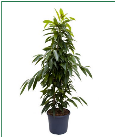
Artcode: 4FIAK1T18 Description: Ficus amstel king Form: Tuft Pot: 35 Height: 150