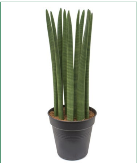
Artcode: 4SACSTU59 Description: Sansevieria straight Form: Tuft Pot: 27 Height: 80