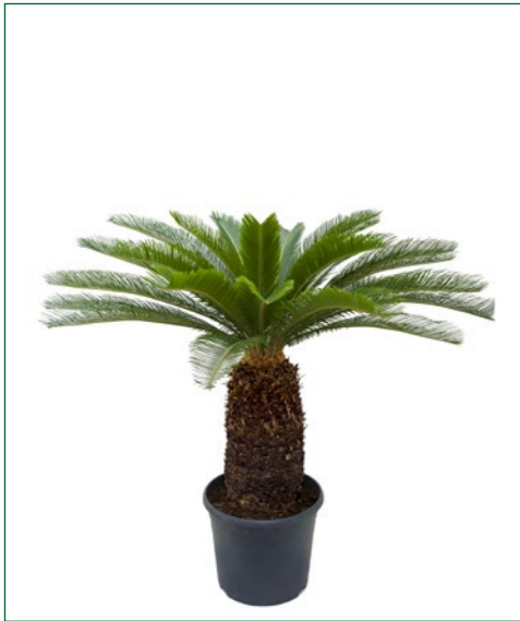
Artcode: 4CYRESS50 Description: Cycas Revoluta Form: Stem (50) Pot: 35 Height: 110