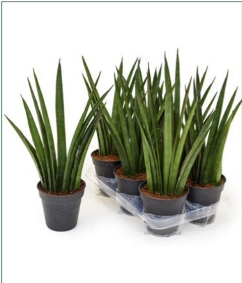
Artcode: 4SANATU15 Description: Sansevieria natcha 6/tray Form: Tuft Pot: 13 Height: 40