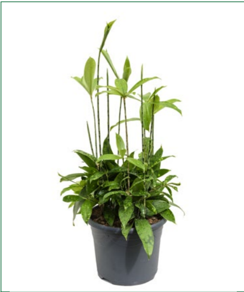
Artcode: 4DRSUBU31 Description: Dracaena Surculosa Form: Bush Pot: 26 Height: 85