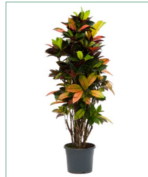
Artcode: 4COICVT48 Description: Croton (codiaeum) iceton Form: Branched Pot: 31 Height: 150