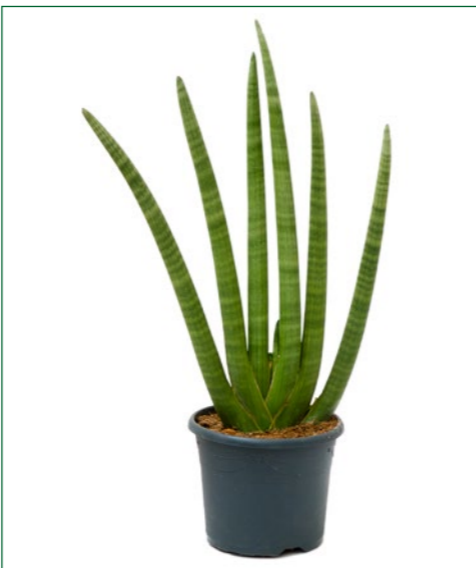
Artcode: 4SACYTU20 Description: Sansevieria cylindrica Form: 5+ Leaves Pot: 26 Height: 85