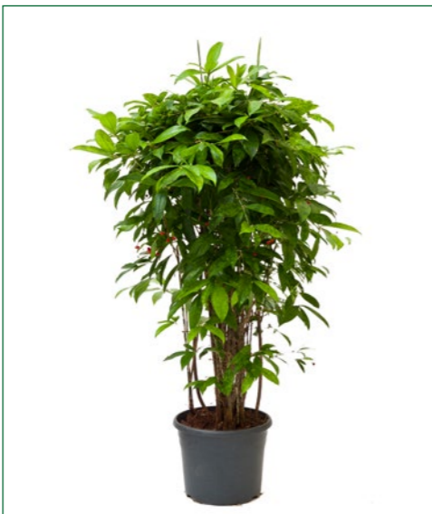
Artcode: 4DRSUBU34 Description: Dracaena surculosa Form: Bush Pot: 31 Height: 130