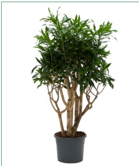
Artcode: 4PLREVT21 Description: Pleomele reflexa Form: Branched (90-100) Pot: 29 Height: 90