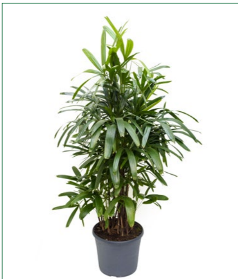
Artcode: 4RHEXBU71 Description: Rhaps excelsa Form: Tuft (140-160) Pot: 35 Height: 160