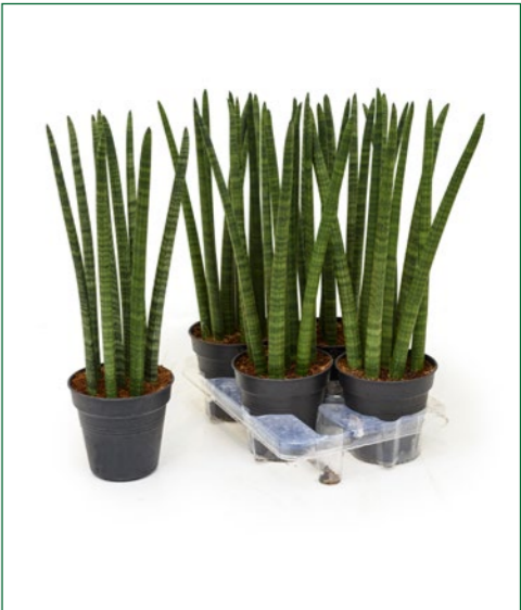
Artcode: 4SACSTU49 Description: Sansevieria straight 4/tray Form: Tuft Pot: 15 Height: 50