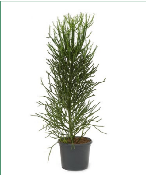
Artcode: 4EUTIKK11 Description: Euphorbia tirucalli Form: Bush Pot: 29 Height: 150