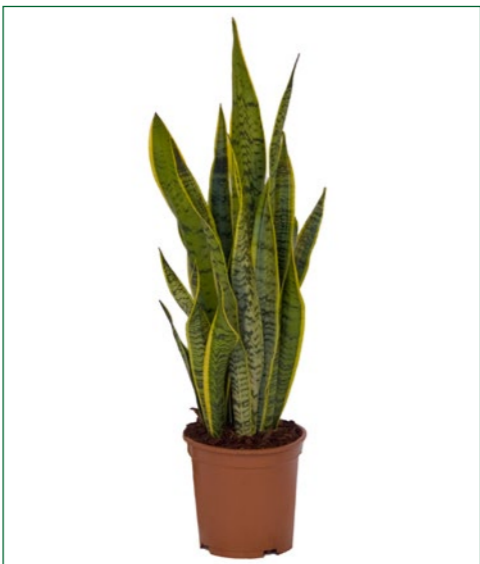
Artcode: 4SALATU40 Description: Sansevieria laurentii Form: Tuft Pot: 21 Height: 50