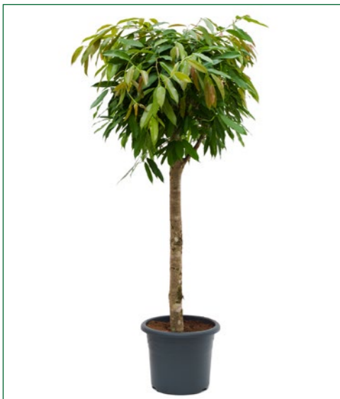
Artcode: 4FIAKRS35 Description: Ficus amstel king Form: Stem Pot: 40 Height: 180