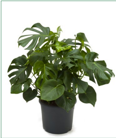
Artcode: 4PHPEBU08 Description: Philodendron pertusum (monstera) Form: Tuft Pot: 31 Height: 85