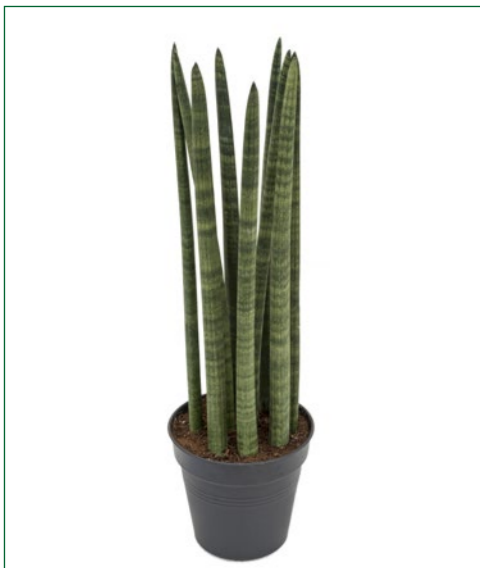
Artcode: 4SACSTU51 Description: Sansevieria straight Form: Tuft Pot: 17 Height: 60