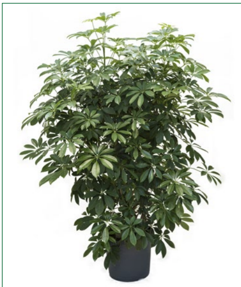
Artcode: 4SCARVT30 Description: Schefflera arboricola Form: Branched Pot: 31 Height: 130