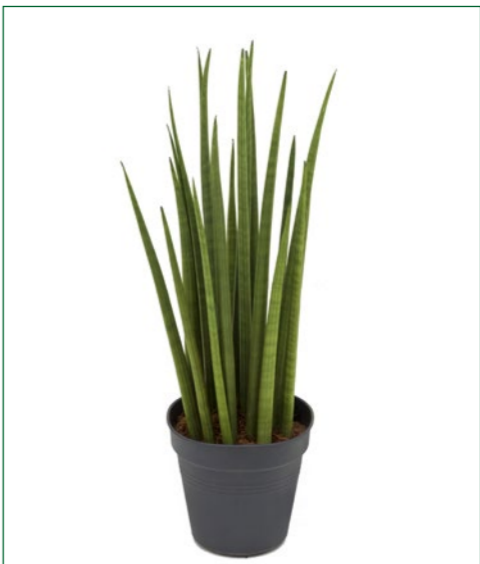
Artcode: 4SASPTU13 Description: Sansevieria spikes Form: Tuft Pot: 17 Height: 60