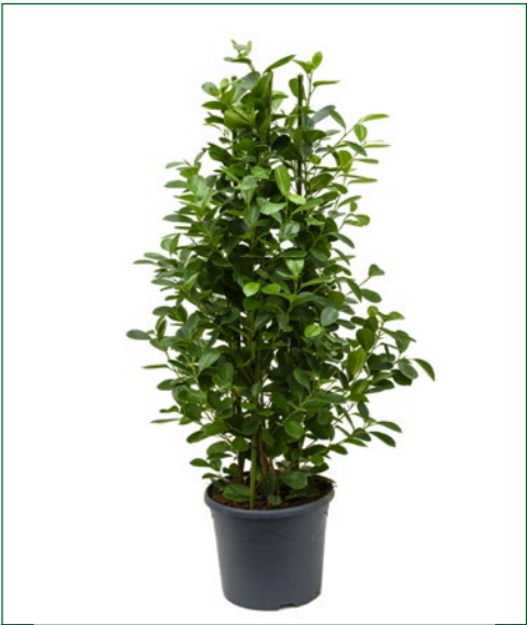
Artcode: 4FIMO3T03 Description: Ficus moclame Form: Tuft Pot: 31 Height: 120