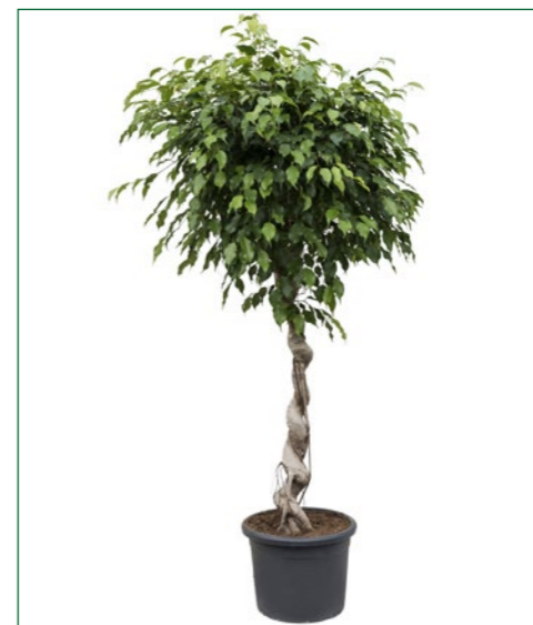
Artcode: 4FIBESS08 Description: Ficus benjamina Form: Spiral Pot: 40 Height: 180