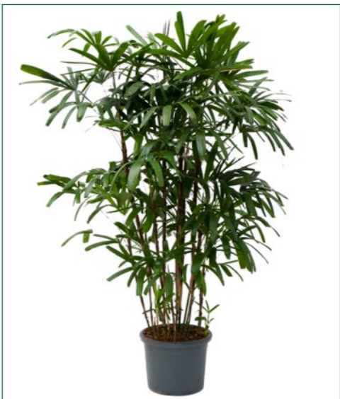
Artcode: 4RHEXBU81 Description: Rhaps excelsa Form: Tuft (190-220) Pot: 45 Height: 190