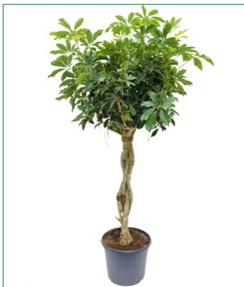
Artcode: 4SCARG527 Description: Schefflera arboricola Form: Stem braided Pot: 35 Height: 160