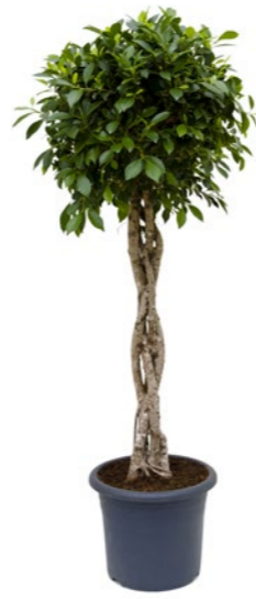
Artcode: 4FINIGS07 Description: Ficus nitida Form: Stem braided Pot: 40 Height: 175