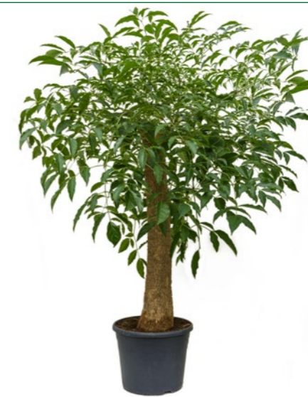
Artcode: 4HECHRS10 Description: Heteropanax chinensis Form: Stem Pot: 35 Height: 150