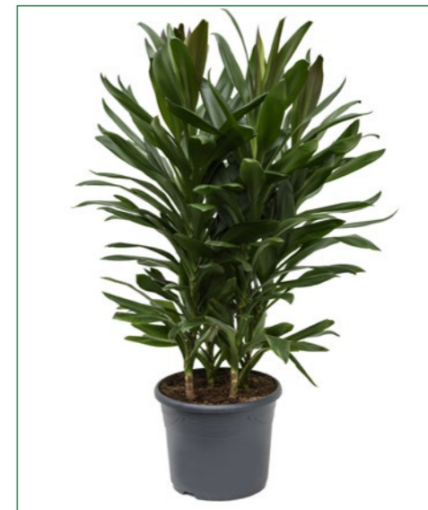
Artcode: 4COGLTU25 Description: Cordyline glauca Form: Tuft 4pp Pot: 26 Height: 60