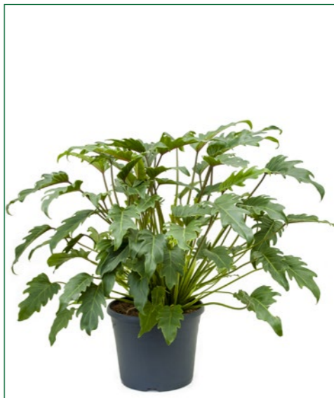
Artcode: 4PHXABU11 Description: Philodendron xanadu Form: Bush Pot: 35 Height: 80