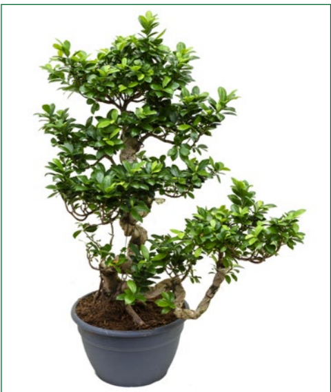
Artcode: 4FIMIHA06 Description: Ficus microcarpa compacta Form: S-stem cascade Pot: 35 Height: 120