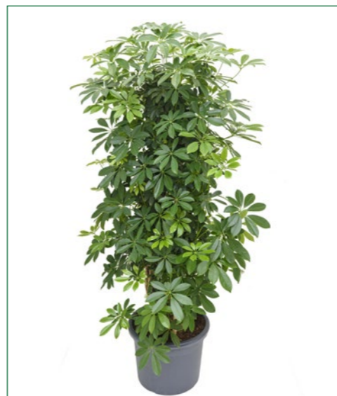
Artcode: 4SCARSS52 Description: Schefflera arboricola Form: Branched/column Pot: 45 Height: 180