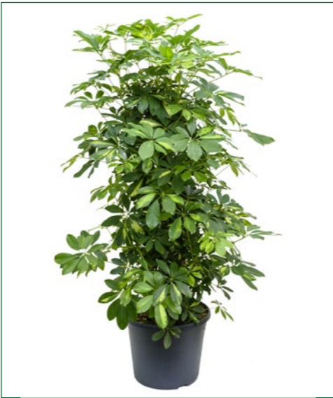
Artcode: 4SCGCS48 Description: Schefflera gold capella Form: Branched/column Pot: 35 Height: 150