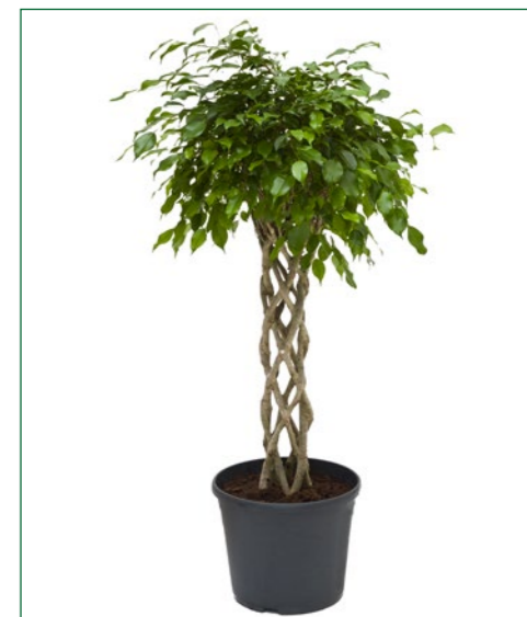
Artcode: 4FIBESS38 Description: Ficus benjamina Form: Cilinder Pot: 35 Height: 150