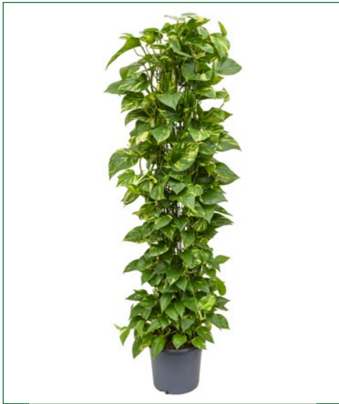
Artcode: 4SCAUZU08 Description: Scindapsus (epipremnum) aureum Form: Column Pot: 29 Height: 150