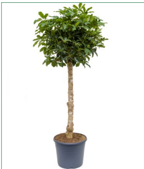
Artcode: 4SCARR510 Description: Schefflera arboricola Form: Stem Pot: 35 Height: 160