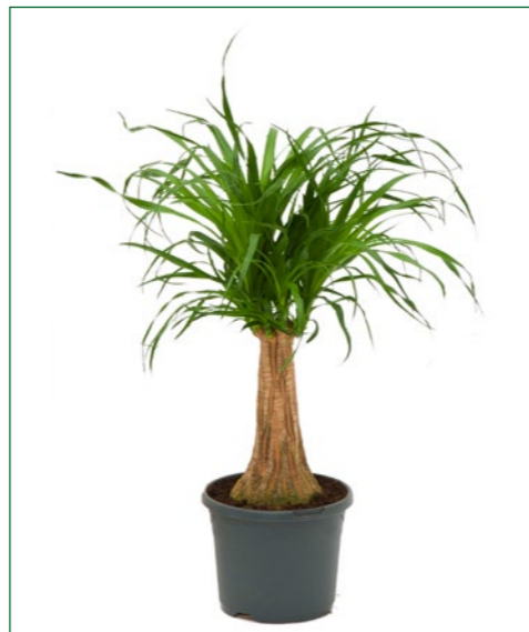
Artcode: 4BERERS40 Description: Beaucarnea recurvata Form: Stem (25) Pot: 19 Height: 60