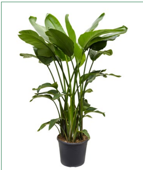
Artcode: 4STNITU14 Description: Strelitzia nicolai Form: Tuft Pot: 35 Height: 170