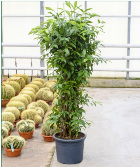
Artcode: 4DRSUBU41 Description: Dracaena surculosa Form: Bush Pot: 40 Height: 220