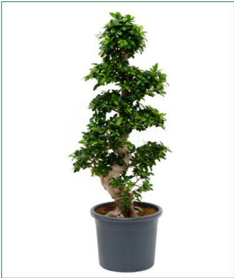
Artcode: 4FIMISS05 Description: Ficus microcarpa compacta Form: S-stem Pot: 50 Height: 190