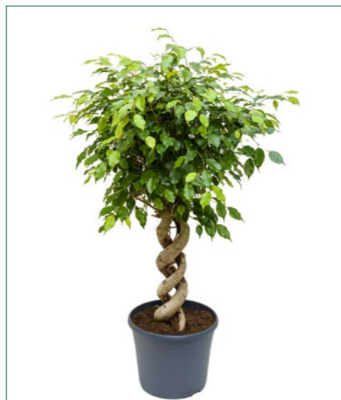
Artcode: 4FIBE2S05 Description: Ficus benjamina Form: Spiral double Pot: 35 Height: 140