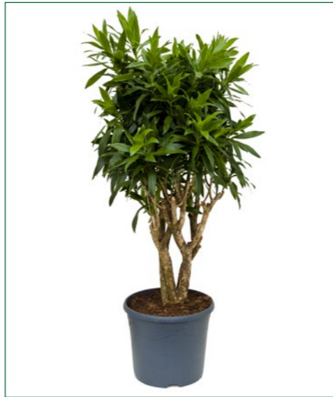
Artcode: 4PLREVT24 Description: Pleomele reflexa Form: Branched Pot: 31 Height: 110