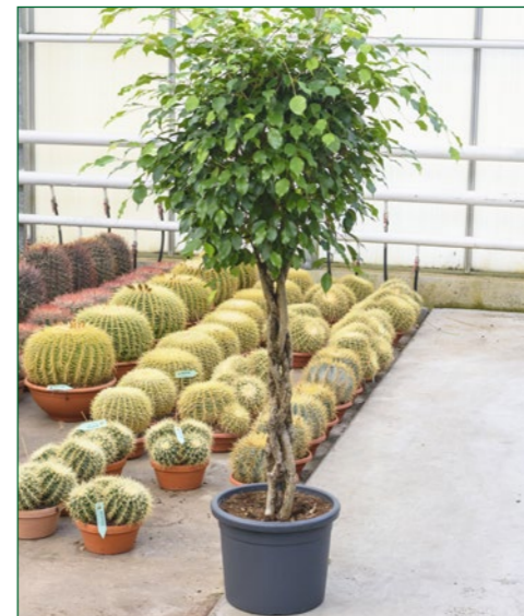
Artcode: 4FIBEGS14 Description: Ficus benjamina Form: Stem braided Pot: 40 Height: 175