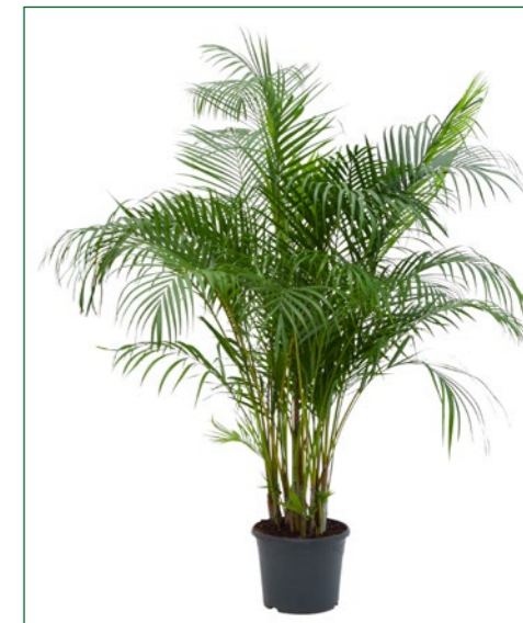
Artcode: 4CHLUBU08 Description: Areca (chrysalidoc.) lutescens Form: Tuft Pot: 29 Height: 140