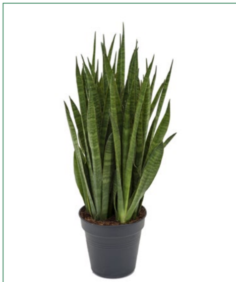
Artcode: 4SAKIBU28 Description: Sansevieria kirkii Form: Tuft Pot: 17 Height: 55