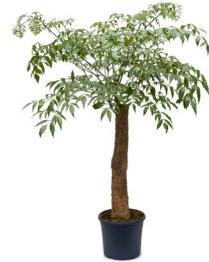
Artcode: 4HECHRS05 Description: Heteropanax chinensis Form: Stem Pot: 31 Height: 130