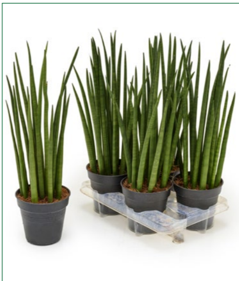
Artcode: 4SASPTU12 Description: Sansevieria spikes 4/tray Form: Tuft Pot: 15 Height: 60