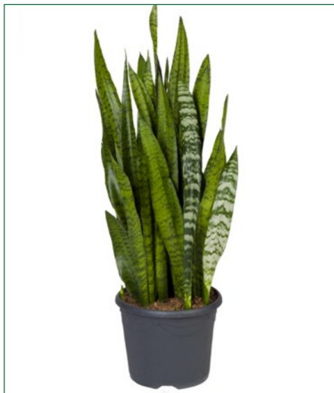
Artcode: 4SAZETU10 Description: Sansevieria zeylanica Form: Tuft Pot: 26 Height: 70