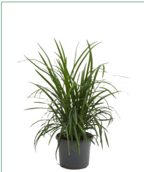
Artcode: 40PJABU14 Description: Ophiopogon japonica Form: Bush Pot: 19 Height: 30