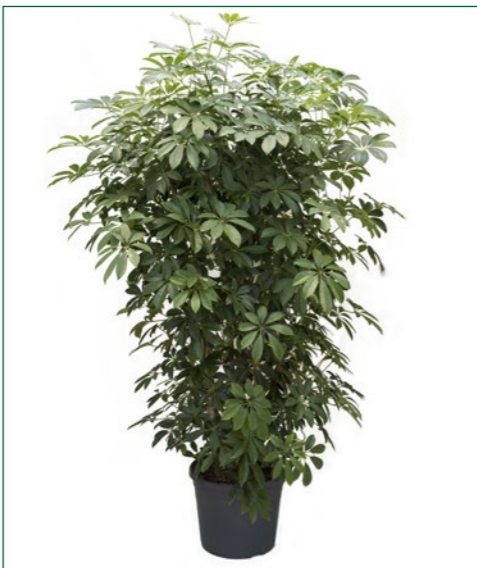
Artcode: 4SCARVT35 Description: Schefflera arboricola Form: Branched Pot: 35 Height: 130