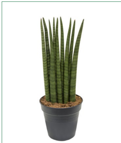
Artcode: 4SACWTU03 Description: Sansevieria wave Form: Tuft Pot: 19 Height: 50