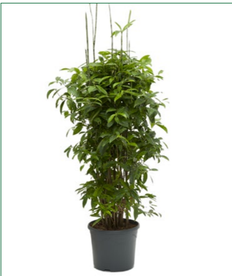
Artcode: 4DRSUBU39 Description: Dracaena surculosa Form: Bush Pot: 35 Height: 180