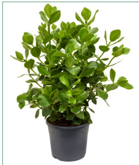
Artcode: 4CLRP2T05 Description: Clusia rosea princess Form: Bush 2pp Pot: 31 Height: 100