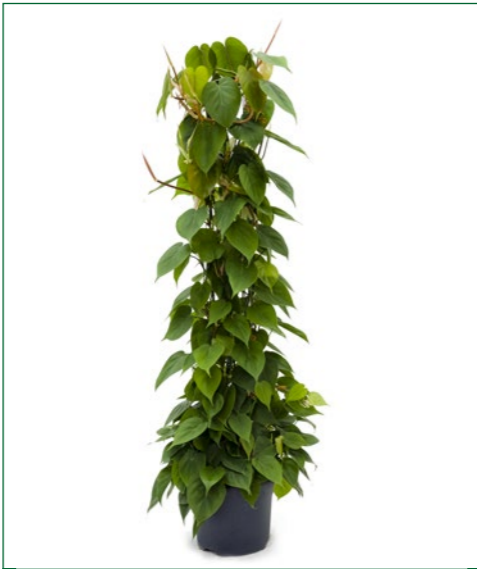
Artcode: 4PHSCZU03 Description: Philodendron scandens Form: Column Pot: 26 Height: 120