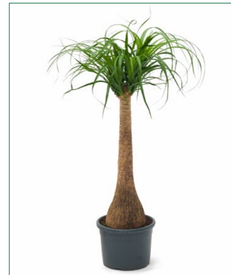
Artcode: 4BERERS46 Description: Beaucarnea recurvata Form: Stem (60) Pot: 22+ Height: 110