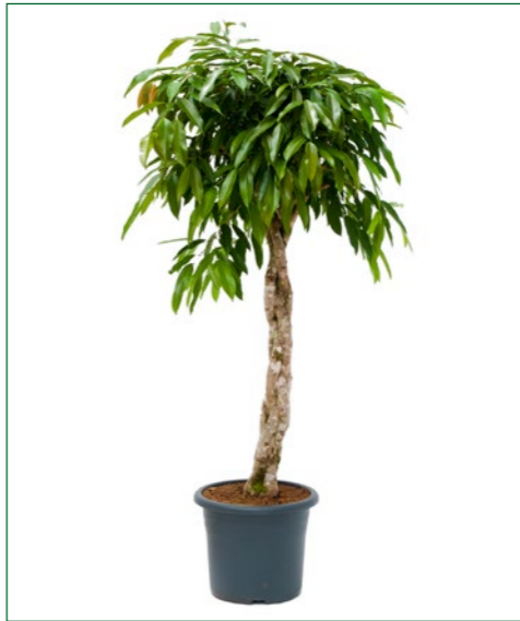
Artcode: 4FIAKGS07 Description: Ficus amstel king Form: Stem braided Pot: 40 Height: 180