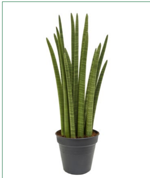
Artcode: 4SACYTU04 Description: Sansevieria tower Form: Tuft Pot: 19 Height: 60