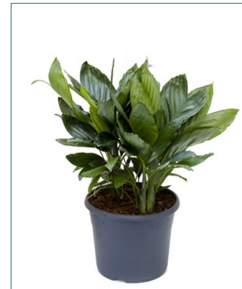
Artcode: 4CHMEBU15 Description: Chamaedorea metalica Form: Bush Pot: 29 Height: 40