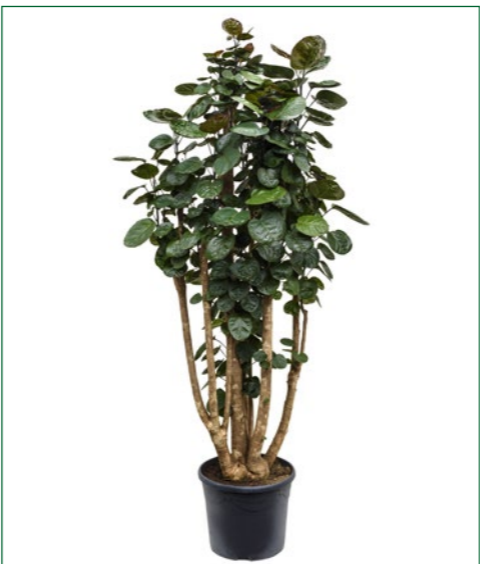
Artcode: 4POFAVT45 Description: Aralia (polyscias) fabian Form: Branched (150-160) Pot: 31 Height: 170