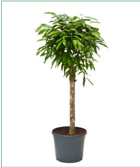
Artcode: 4FIAKRS33 Description: Ficus amstel king Form: Stem Pot: 35 Height: 150