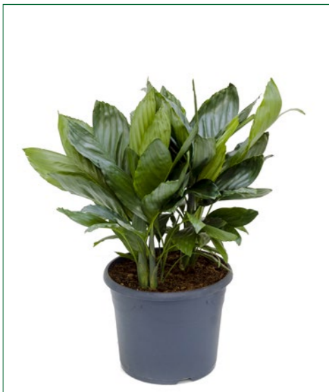
Artcode: 4CHMEBU18 Description: Chamaedorea metalica Form: Bush Pot: 31 Height: 40