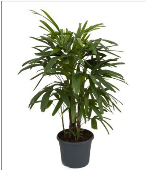
Artcode: 4RHEXBU68 Description: Rhaps excelsa Form: Tuft Pot: 26 Height: 100