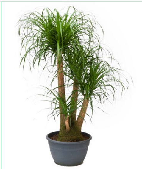
Artcode: 4BEREVT83 Description: Beaucarnea recurvata Form: Branched (80) Pot: 35 Height: 130