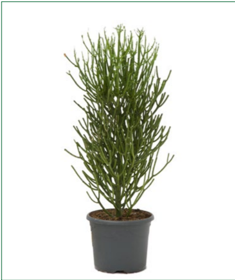
Artcode: 4EUTIKK09 Description: Euphorbia tirucalli Form: Bush Pot: 26 Height: 100