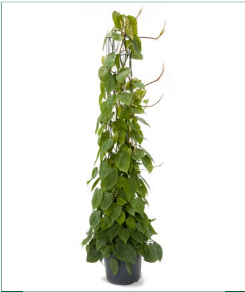
Artcode: 4PHSCZU08 Description: Philodendron scandens Form: Column Pot: 29 Height: 150