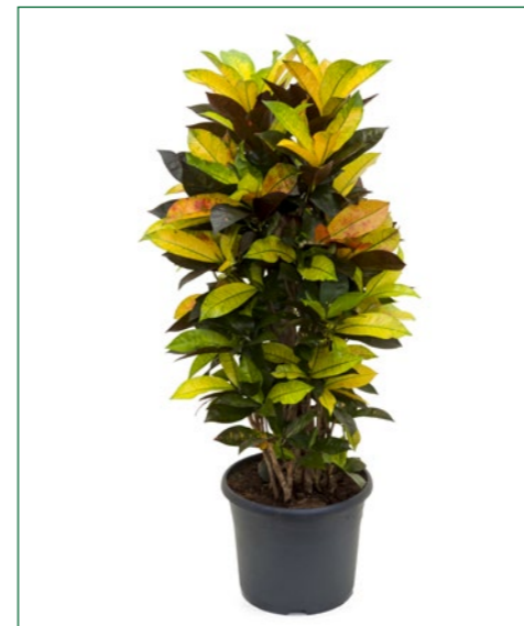
Artcode: 4COICVT44 Description: Croton (codiaeum) iceton Form: Branched Pot: 29 Height: 110