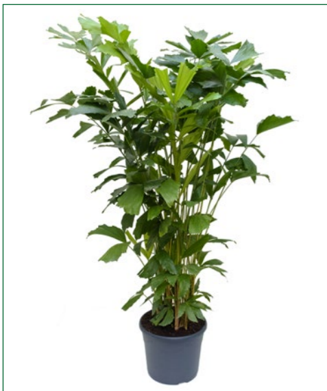
Artcode: 4CAMIBU19 Description: Caryota mitis Form: Bush Pot: 31 Height: 150