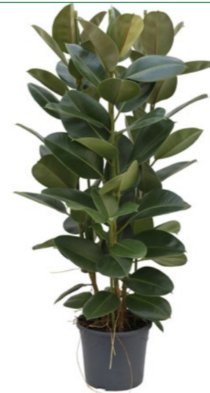
Artcode: 4FIRO3T15 Description: Ficus robusta Form: Tuft Pot: 31 Height: 150