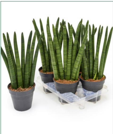
Artcode: 4SACWTU01 Description: Sansevieria wave 4/tray Form: Tuft Pot: 15 Height: 45