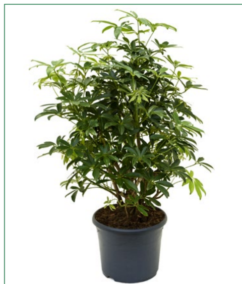
Artcode: 4SCARVT25 Description: Schefflera arboricola Form: Branched Pot: 29 Height: 120