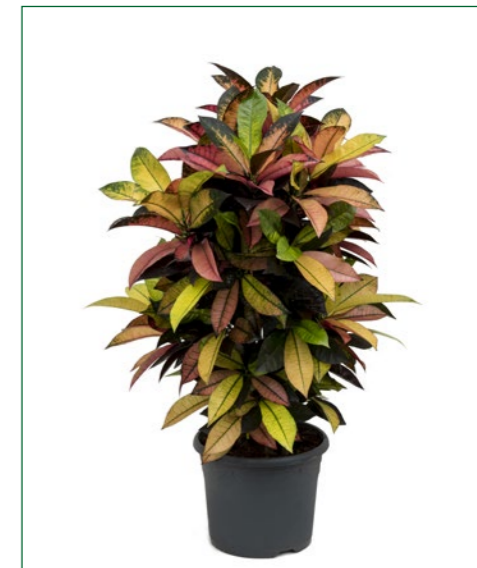
Artcode: 4COICVT08 Description: Croton (codiaeum) iceton Form: Branched Pot: 26 Height: 90