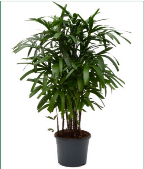
Artcode: 4RHEXBU69 Description: Rhaps excelsa Form: Tuft (120-130) Pot: 31 Height: 140