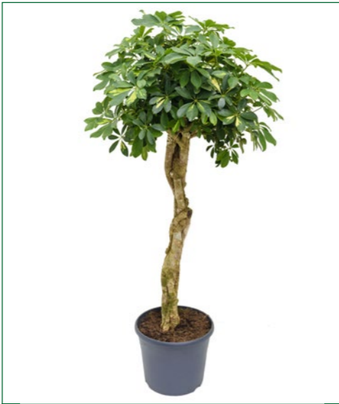
Artcode: 4SCGGS31 Description: Schefflera gold capella Form: Stem braided Pot: 35 Height: 160