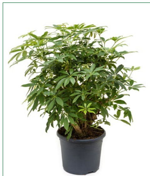
Artcode: 4SCARVT08 Description: Schefflera arboricola Form: Branched Pot: 26 Height: 100