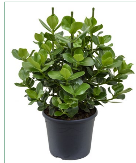
Artcode: 4CLRP3T08 Description: Clusia rosea princess Form: Bush 3pp Pot: 35 Height: 120