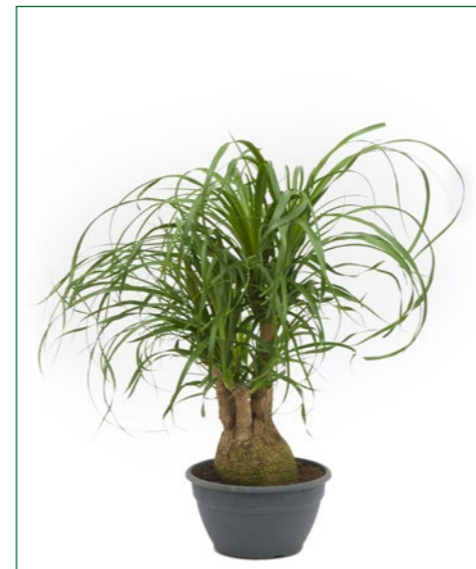
Artcode: 4BEREVT04 Description: Beaucarnea recurvata Form: Branched (25) saucer ø15 Pot: 20 Height: 60