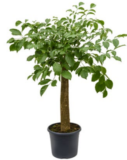
Artcode: 4HECHRS03 Description: Heteropanax chinensis Form: Stem Pot: 29 Height: 120