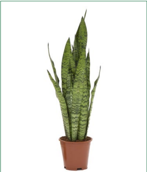
Artcode: 4SAZETU06 Description: Sansevieria zeylanica Form: Tuft Pot: 17 Height: 50