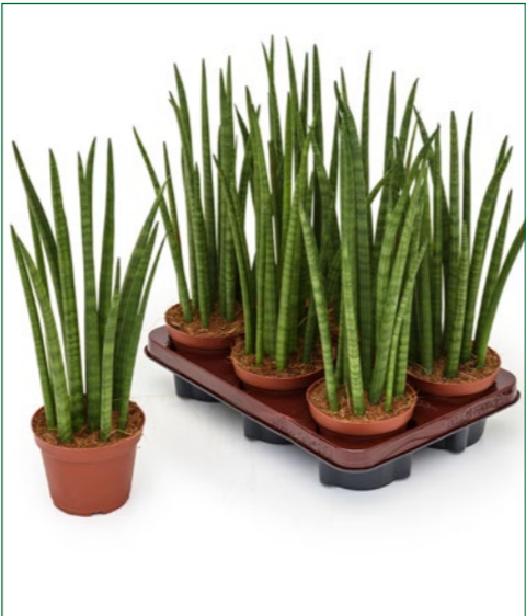
Artcode: 4SASPTU40 Description: Sansevieria spike 6/tray Form: Tuft Pot: 12 Height: 45