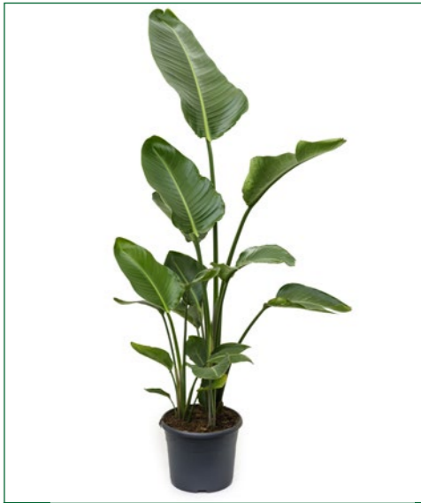
Artcode: 4STNITU12 Description: Strelitzia nicolai Form: Tuft Pot: 29 Height: 150