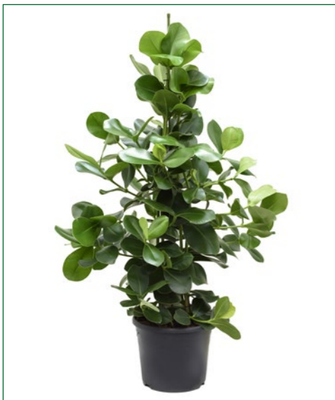
Artcode: 4CLROTU15 Description: Clusia rosea Form: Tuft Pot: 35 Height: 150