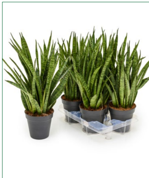
Artcode: 4SAKIBU25 Description: Sansevieria kirkii 4/tray Form: Tuft Pot: 15 Height: 50