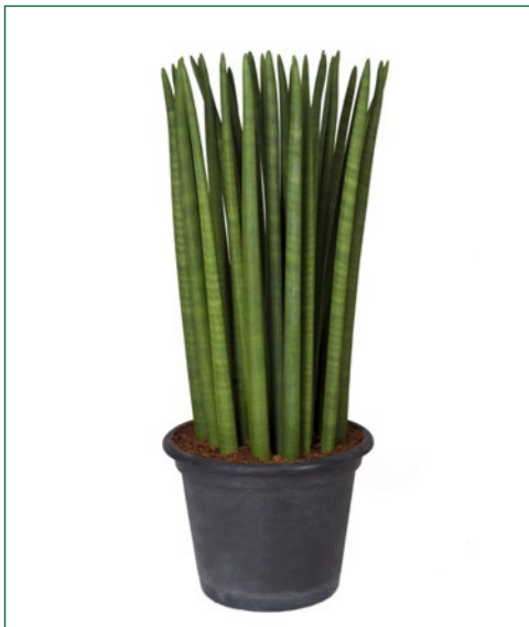
Artcode: 4SACSTU60 Description: Sansevieria straight Form: Tuft Pot: 35 Height: 100