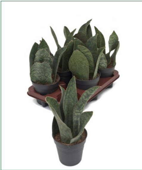
Artcode: 4SAGOTU02 Description: Sansevieria masiona gongo 6/tray Form: Tuft Pot: 13 Height: 30