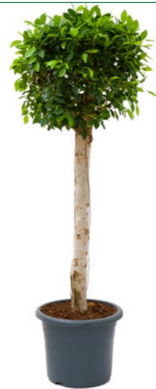
Artcode: 4FINIRS11 Description: Ficus nitida Form: Stem Pot: 40 Height: 180