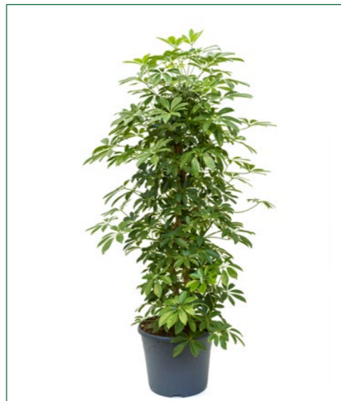
Artcode: 4SCARSS44 Description: Schefflera arboricola Form: Branched/column Pot: 35 Height: 150