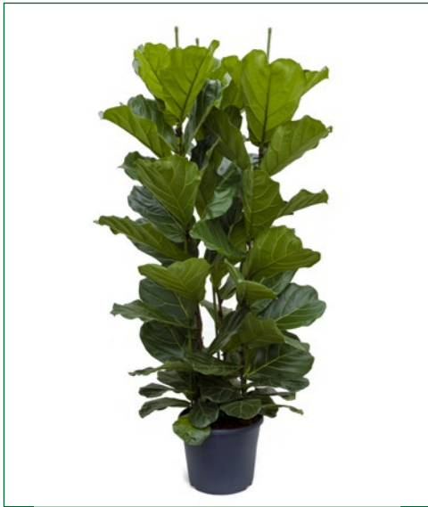
Artcode: 4FILY3T18 Description: Ficus lyrata Form: Tuft Pot: 35 Height: 180