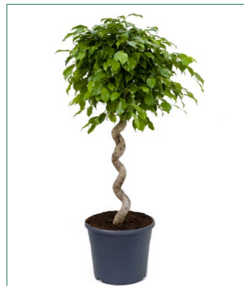
Artcode: 4FIBESS06 Description: Ficus benjamina Form: Spiral Pot: 35 Height: 150