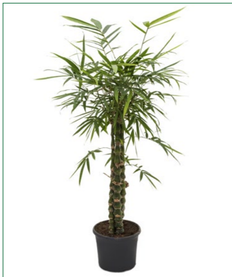
Artcode: 4BAVEBU10 Description: Bambusa ventricosa Form: Bush Pot: 29 Height: 140