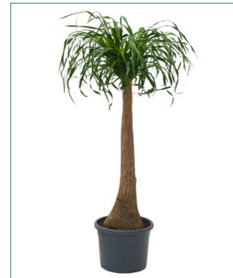
Artcode: 4BERERS50 Description: Beaucarnea recurvata Form: Stem (80) Pot: 24+ Height: 125