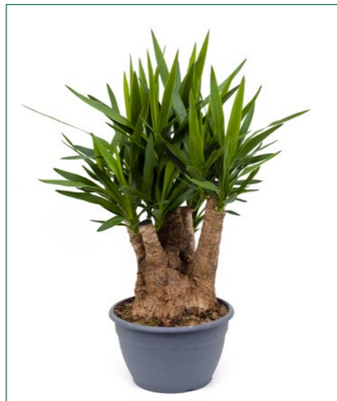
Artcode: 4YUELVT81 Description: Yucca elephantipes Form: Branched Pot: 30 Height: 100