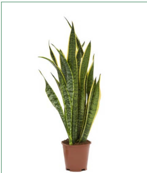
Artcode: 4SALATU55 Description: Sansevieria laurentii Form: Tuft Pot: 17 Height: 45