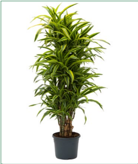
Artcode: 4DRLLVT20 Description: Dracaena Lemon Lime Form: Branched-multi Pot: 31 Height: 140