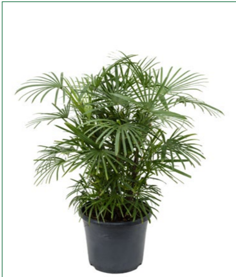
Artcode: 4RHHUBU15 Description: Rhaps humilis Form: Bush Pot: 29 Height: 80