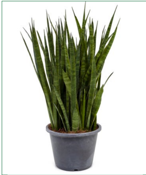
Artcode: 4SAKIBU35 Description: Sansevieria kirkii Form: Tuft Pot: 27 Height: 70