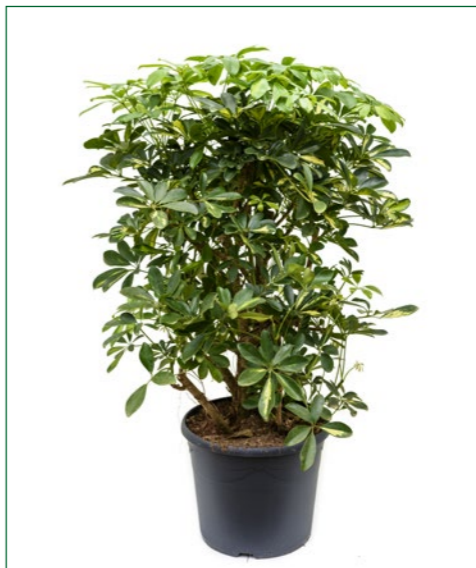
Artcode: 4SCGCVT15 Description: Schefflera gold capelle Form: Branched Pot: 35 Height: 130