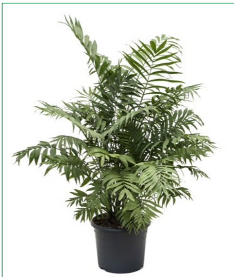
Artcode: 4CHELTU29 Description: Chamaedorea elegans Form: Tuft Pot: 29 Height: 100