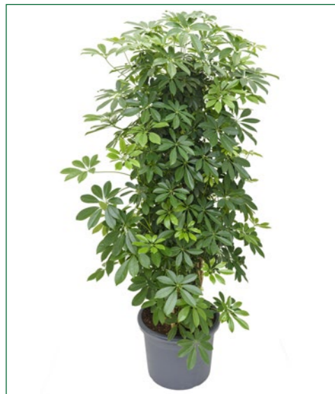
Artcode: 4SCARSS48 Description: Schefflera arboricola Form: Branched/column Pot: 40 Height: 170