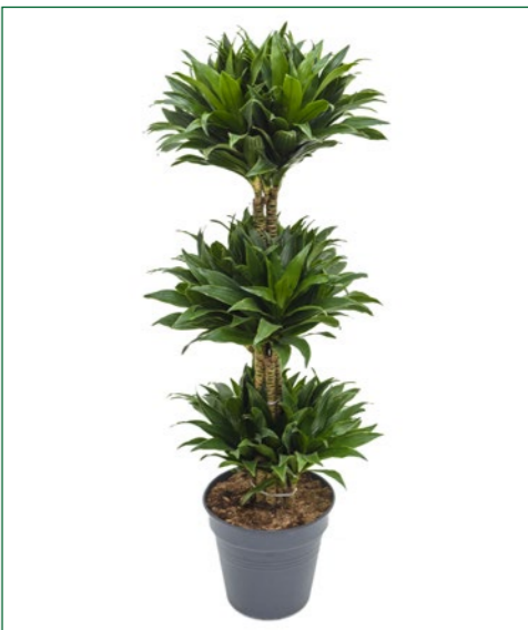
Artcode: 4DRCOBA09 Description: Dracaena Compacta Form: 90-Ballerina Pot: 31 Height: 140