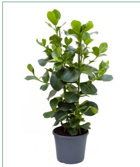
Artcode: 4CLROTU10 Description: Clusia rosea Form: Tuft Pot: 35 Height: 120