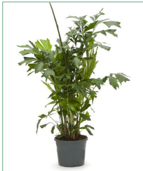
Artcode: 4CAMIBU13 Description: Caryota mitis Form: Tuft Pot: 29 Height: 140