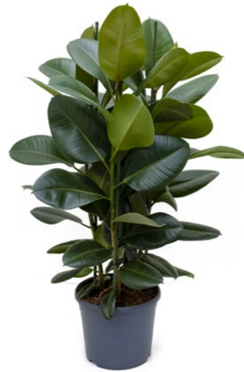
Artcode: 4FIRO3T11 Description: Ficus robusta Form: Tuft Pot: 31 Height: 120