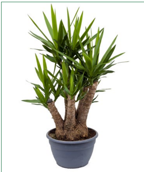
Artcode: 4YUELVT83 Description: Yucca elephantipes Form: Branched Pot: 35 Height: 130