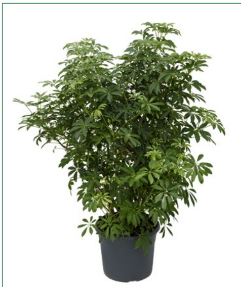
Artcode: 4SCLOVT20 Description: Schefflera louisiana Form: Branched Pot: 31 Height: 100