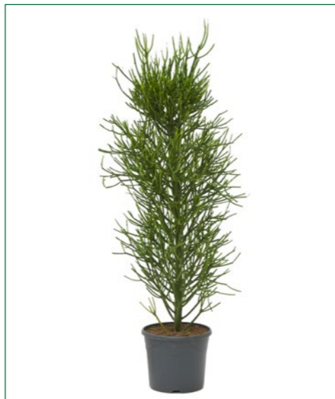
Artcode: 4EUTIKK17 Description: Euphorbia tirucalli Form: Bush Pot: 31 Height: 160