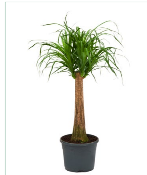
Artcode: 4BERERS43 Description: Beaucarnea recurvata Form: Stem (40) Pot: 22 Height: 80