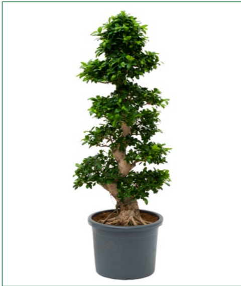
Artcode: 4FIMISS06 Description: Ficus microcarpa compacta Form: S-Stem Pot: 45 Height: 180