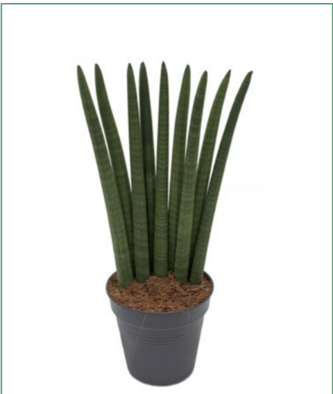
Artcode: 4SACWTU02 Description: Sansevieria wave Form: Tuft Pot: 17 Height: 50