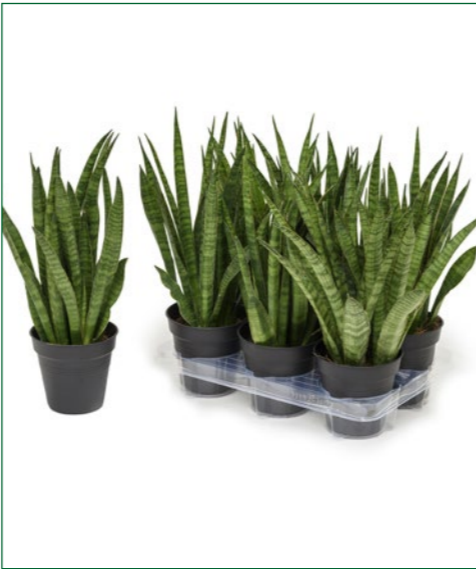
Artcode: 4SAKIBU11 Description: Sansevieria kirkii 6/tray 206 Form: Tuft Pot: 13 Height: 40