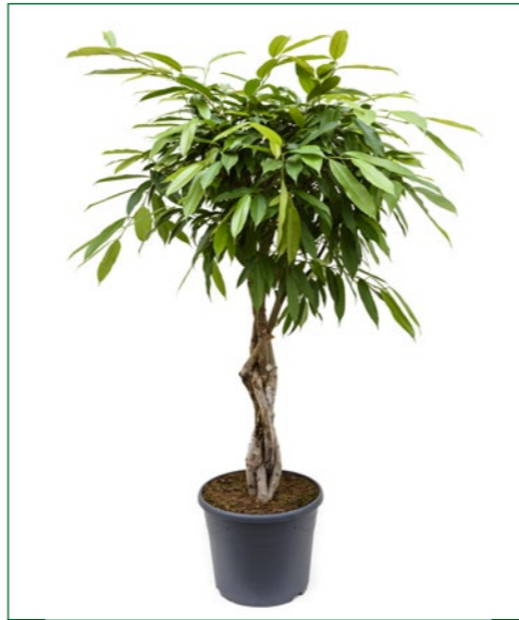
Artcode: 4FIAKGS04 Description: Ficus amstel king Form: Stem braided Pot: 35 Height: 140