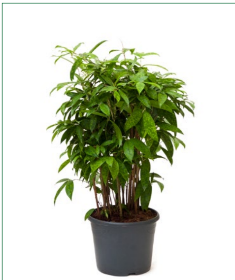
Artcode: 4DRSUBU44 Description: Dracaena surculosa Form: Bush (90-100) Pot: 29 Height: 110