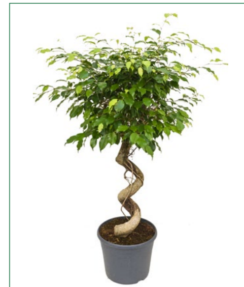
Artcode: 4FIBEKS41 Description: Ficus benjamina Form: Stem corkscrew Pot: 35 Height: 150