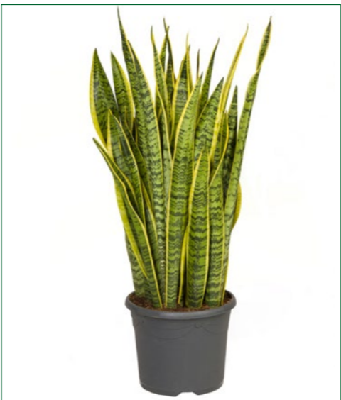
Artcode: 4SALATU05 Description: Sansevieria laurentii Form: Tuft Pot: 26 Height: 60