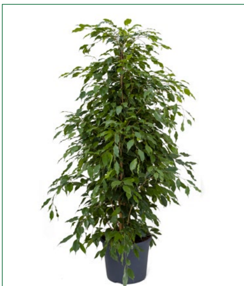
Artcode: 4FIBE1T18 Description: Ficus benjamina Form: Tuft Pot: 35 Height: 150