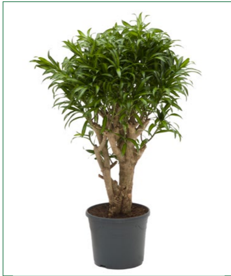
Artcode: 4PLSJT22 Description: Pleomele song of jamaica Form: Branched Pot: 29 Height: 90