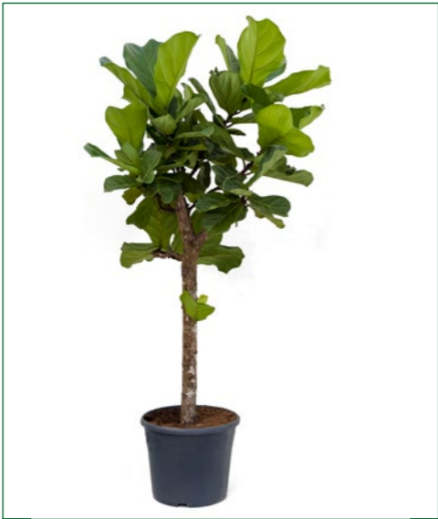
Artcode: 4FILYRS03 Description: Ficus lyrata Form: Stem Pot: 35 Height: 150