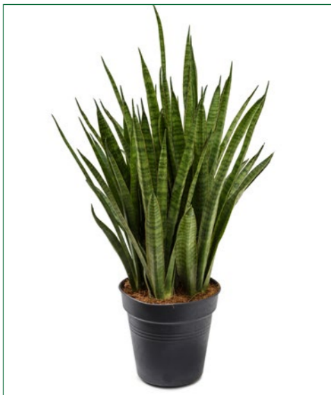
Artcode: 4SAKIBU27 Description: Sansevieria kirkii Form: Tuft Pot: 19 Height: 55