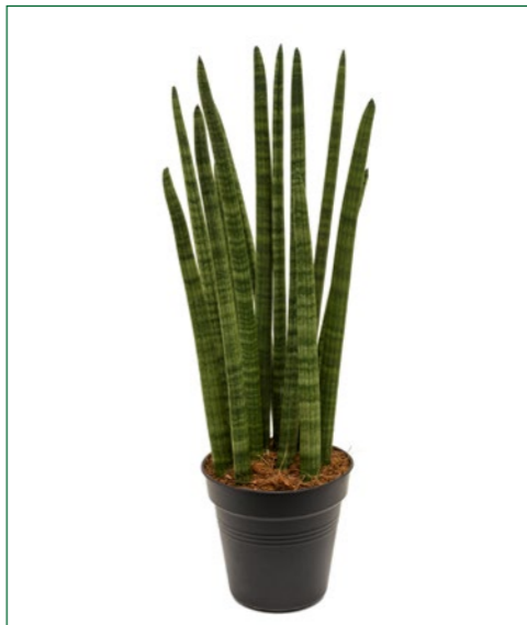
Artcode: 4SACYTU17 Description: Sansevieria tower Form: Tuft Pot: 17 Height: 60