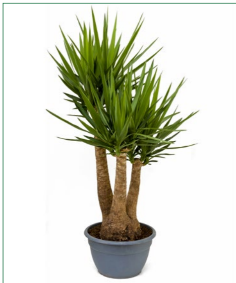
Artcode: 4YUELVT85 Description: Yucca elephantipes Form: Branched Pot: 40 Height: 170